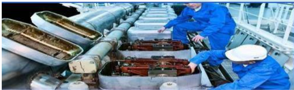
AUXILARY ENGINE OVERHAULING